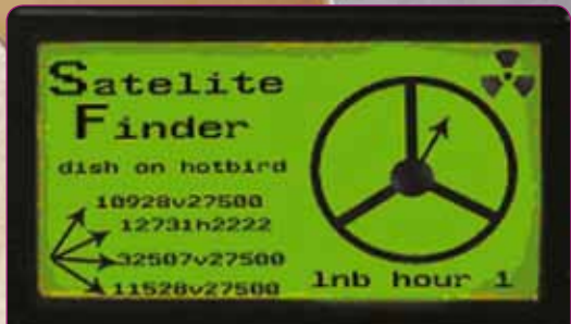
■ The display of the intelligent satellite finder showing the strongest transponders along with the LNB skew.