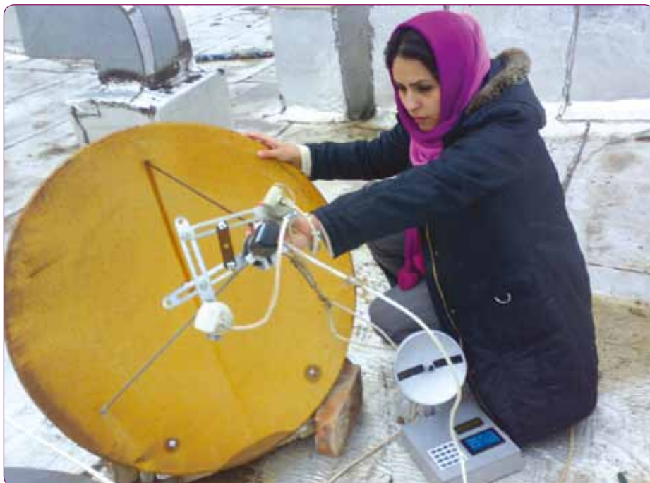
■ This is how the intelligent satellite finder is used: it shows the position of the satellites that are to be received and the real antenna is simply placed parallel to it.