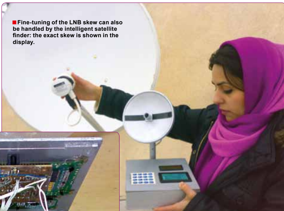
■ Fine-tuning of the LNB skew can also be handled by the intelligent satellite finder: the exact skew is shown in the display.