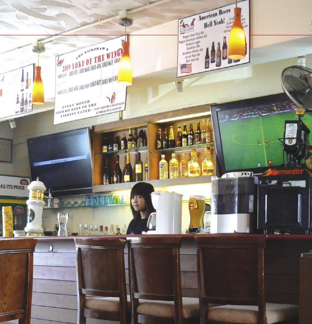
■ Sports programming is constantly running on the flat screen TV's in the bar.