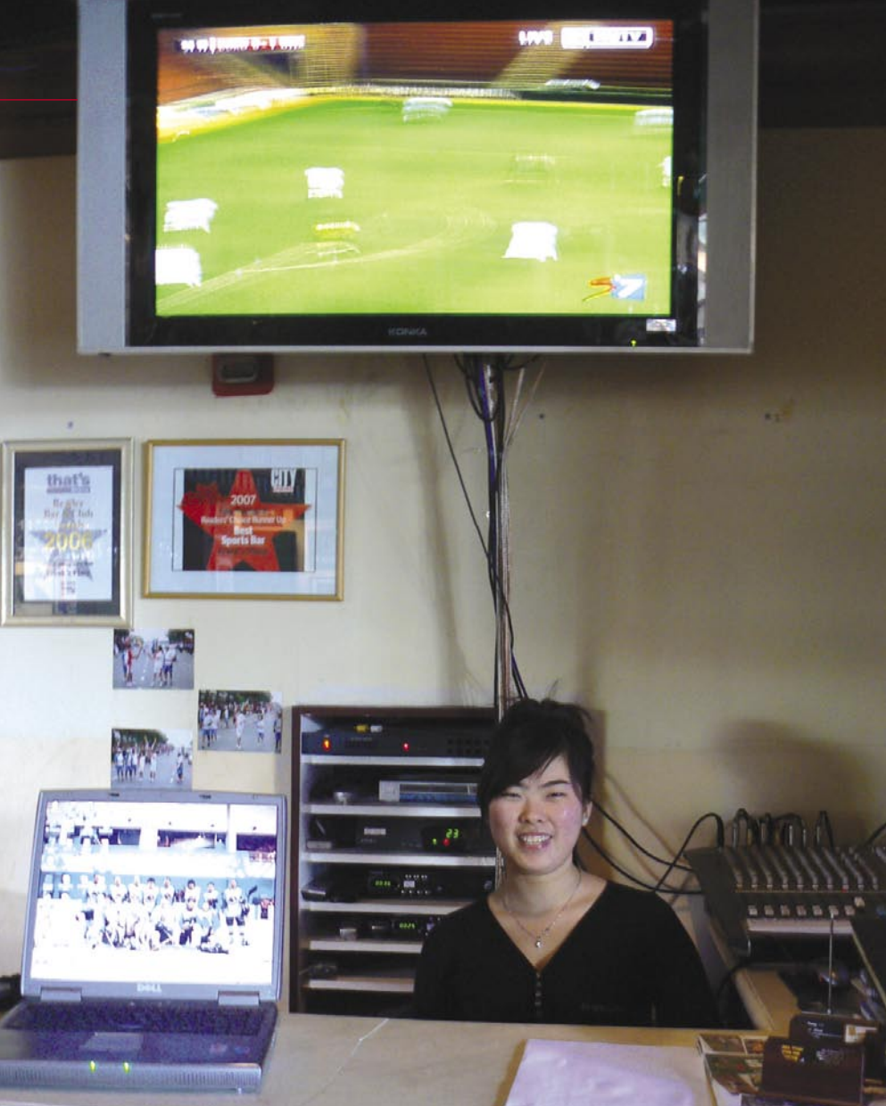
■ Hebe is one of the bartenders in Frank's Place and is seen here standing in front of the shack containing the receivers. A friend in the USA is even providing access to the TSN sports channel via a Slingbox. Frank's claim is really true: "The best coverage of TV sport."