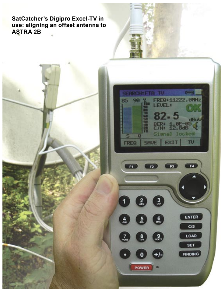
SatCatcher's Digipro Excel-TV in use: aligning an offset antenna to ASTRA 2B

installation site. Both can be set very conveniently using the SatCatcher software. Dozens of cities worldwide are pre-stored so that in many cases it is not necessary to look up your own location and enter it manually. Of course the list can be edited