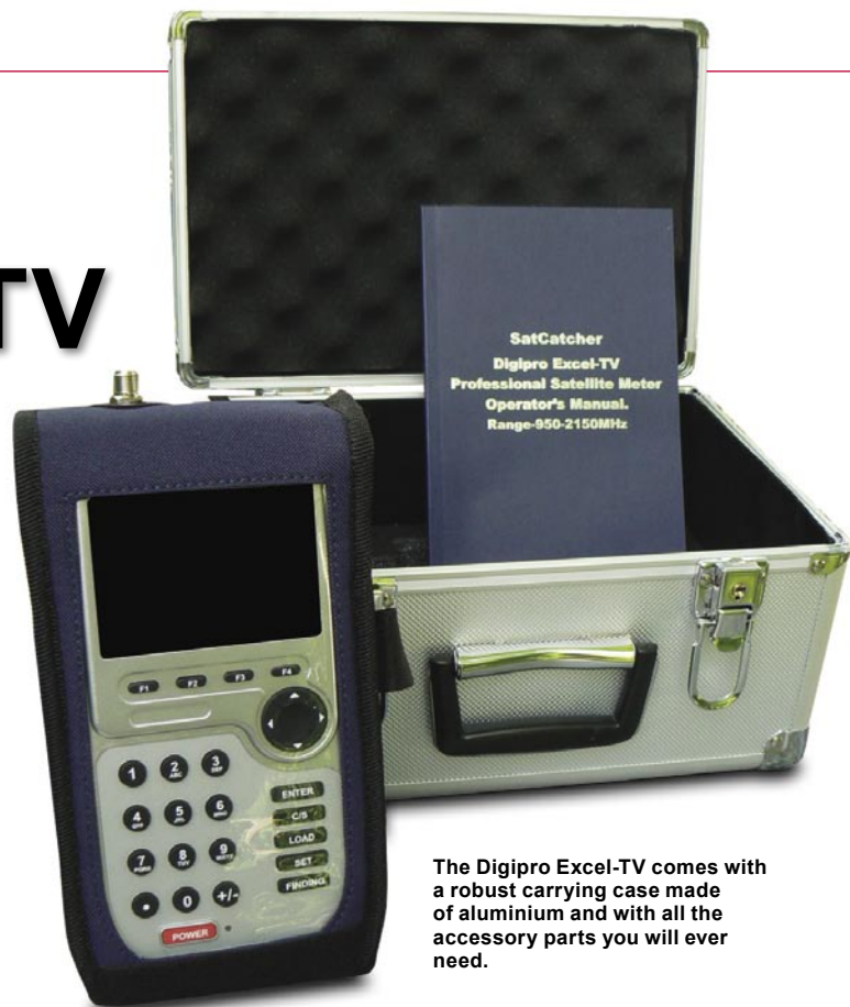
The Digipro Excel-TV comes with a robust carrying case made of aluminium and with all the accessory parts you will ever need.

When we had a look at the technical specifications of the Digipro Excel-TV during our tests we were surprised to read that the meter is operational for up to five hours before the built-in battery needs to be recharged. When compared to many competing meters – whose batteries usually last no longer than two to three hours – this is a remarkable achievement, and one that we were able to verify in our test too. In order to ensure this long battery power the meter should be charged from the mains for at least four to five hours before