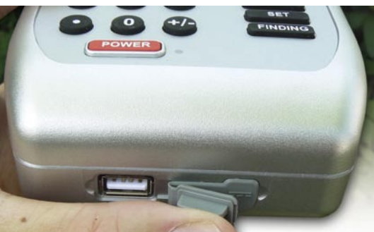
USB interface for connecting the device to the PC next to the socket for power supply.