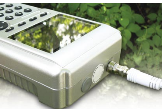
F-socket for connecting the LNB on the top side.

and C bands, or any other available band for that matter.