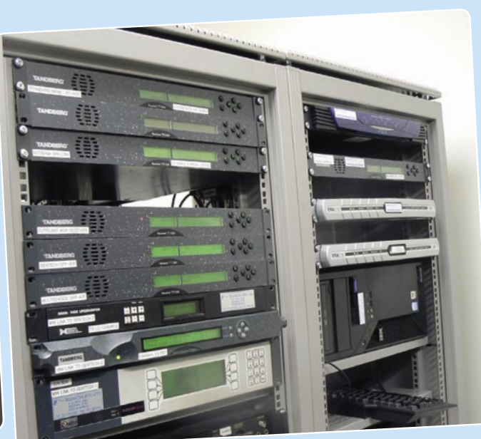
The signals are processed here. The Tandberg slots are for satellite operations. The slots for the terrestrial microwave link to SENTECH, the South African service provider for distribution of the signals.