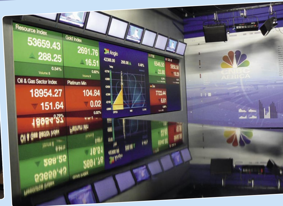
A look in the CNBC Africa studio