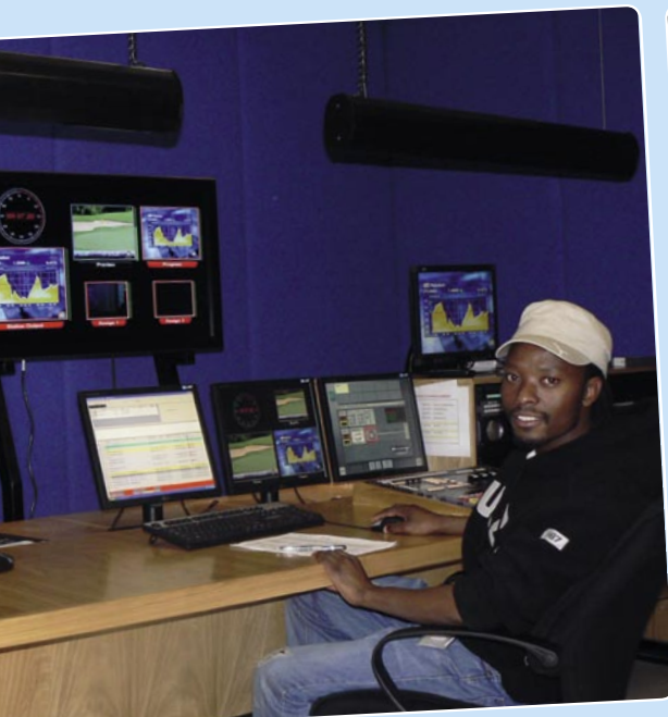
Operators in the Final Control Center. to the satellites.

They also plan to continue transmitting FTA in order to reach as many viewers as possible. They are very ambitious!