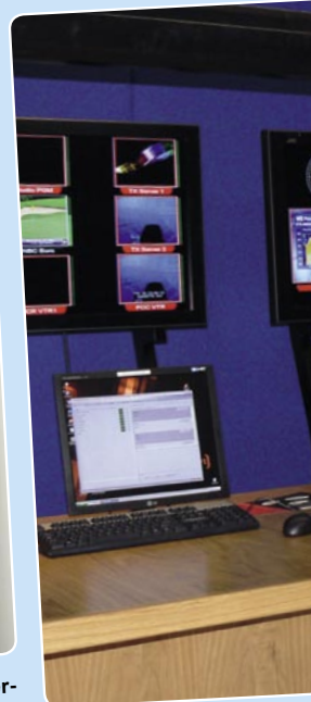
Freddy is one of the operators. From here the signal goes...