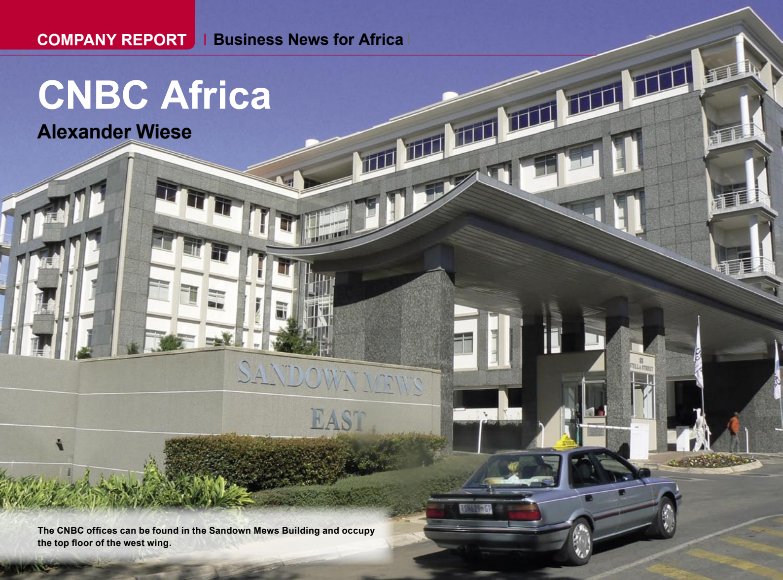
The CNBC offices can be found in the Sandown Mews Building and occupy the top floor of the west wing.